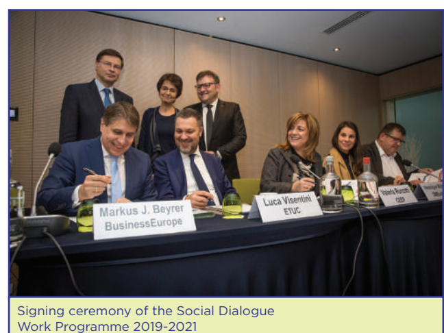
Signing ceremony of the Social Dialogue Work Programme 2019-2021