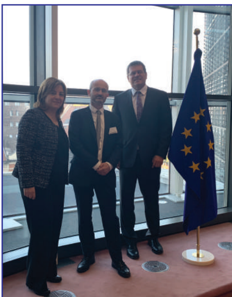
CEEP meeting with Maroš Šefčovič, European Commission Vice-President for the Energy Union

In December 2018, the European Council and the European Parliament reached a provisional agreement on the Electricity Market Design Directive and Regulation. CEEP welcomed the reached agreement and would like to express its gratitude towards our members for their excellent and hard work over the past two years.