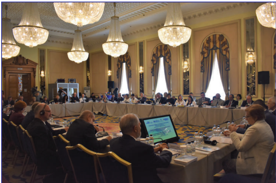
CEEP high-level seminar on 'Public Services and SGIs as Drivers of Sustainable Development and Growth in Europe' at the Balkan Hotel (Sofia, Bulgaria)