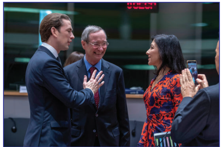
Katherina Reiche, CEEP President, with Sebastian Kurz, Chancellor of Austria, at the Tripartite Social Summit