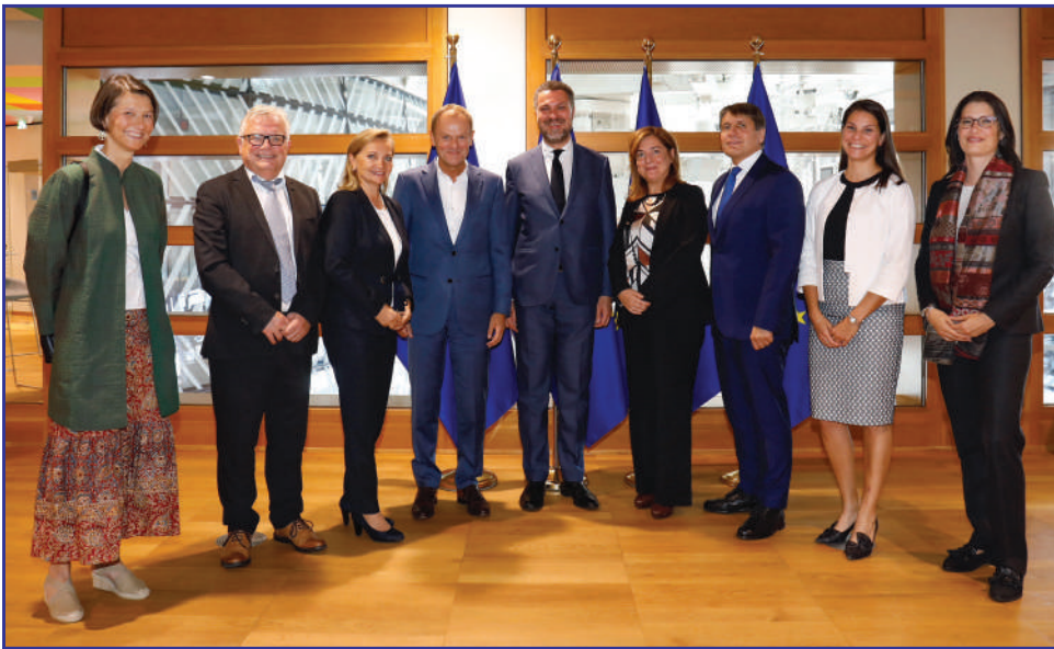
EU social partners' meeting with Donald Tusk, President of the European Council