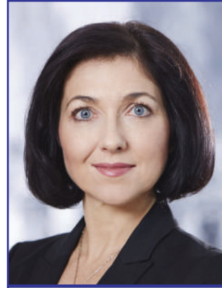
Katherina Reiche, President