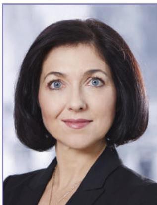
Katherina REICHE (DE)