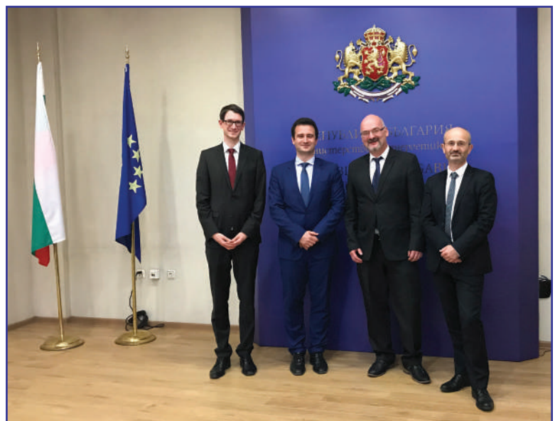
Delegation of CEEP Energy Task Force meeting with Zhecho Stankov, Bulgarian Deputy Energy Minister for the Bulgarian Presidency, on 1 June 2018