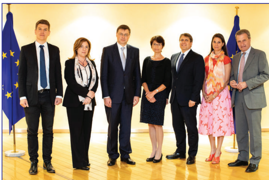
Meeting of the Social Partners with European Commission Vice-President Dombrovskis, Commissioner Oettinger and Commissioner Thyssen