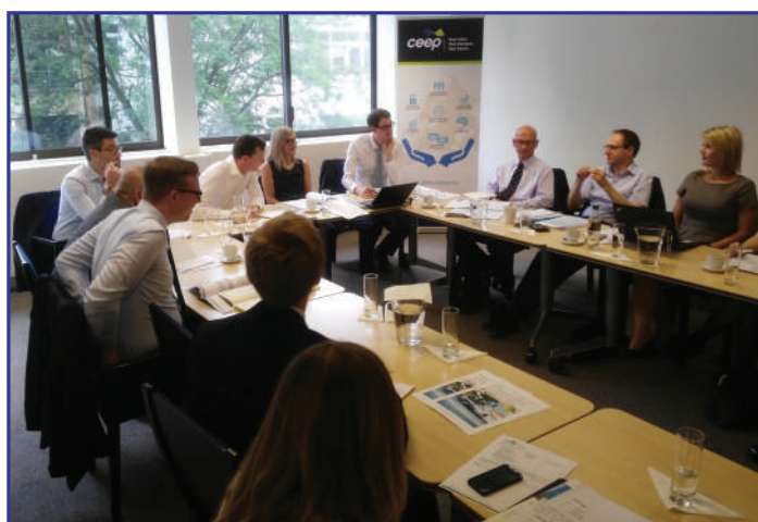
MEP Seb Dance at meeting of CEEP Transport Task Force