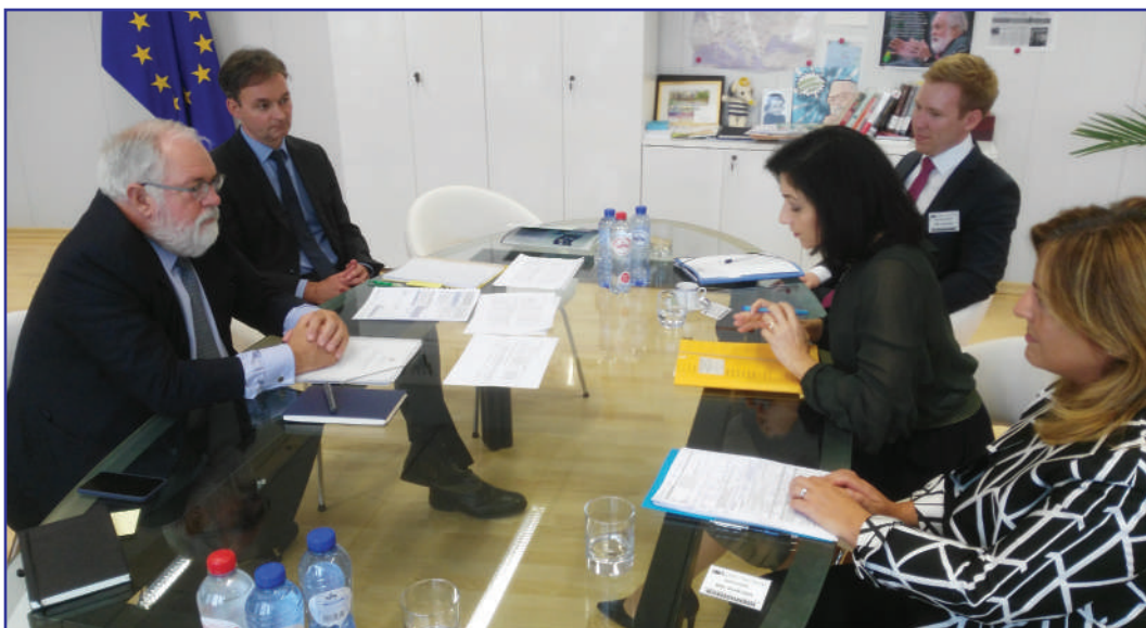
CEEP meeting with Miguel Arias Cañete, European Commissioner for Climate Change and Energy