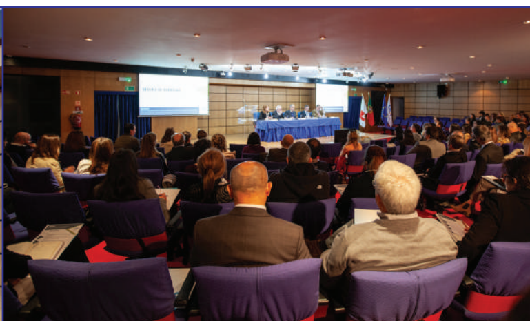
Seminar organised by CEEP Portugal on the Corporate Social Responsibility, with the participation of José Vieira da Silva, Minister of Solidarity, Employment and Social Security