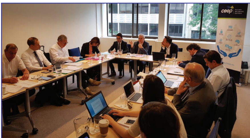
MEP Michel Dantin, rapporteur on the Drinking Water Directive at meeting of CEEP Water Task Force