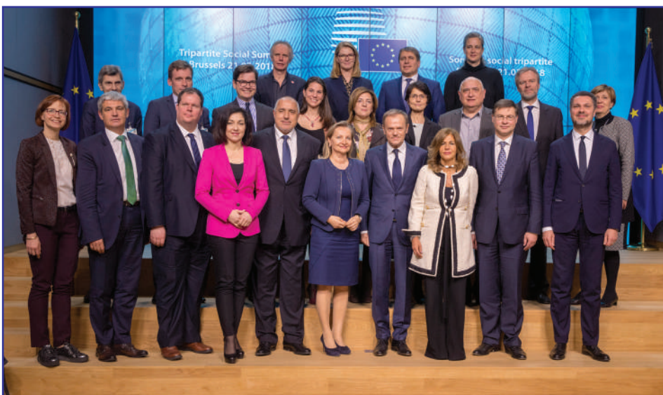
Family photo at the Tripartite Social Summit