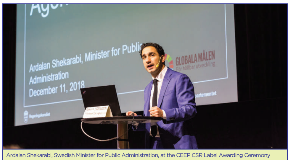
Ardalan Shekarabi, Swedish Minister for Public Administration, at the CEEP CSR Label Awarding Ceremony