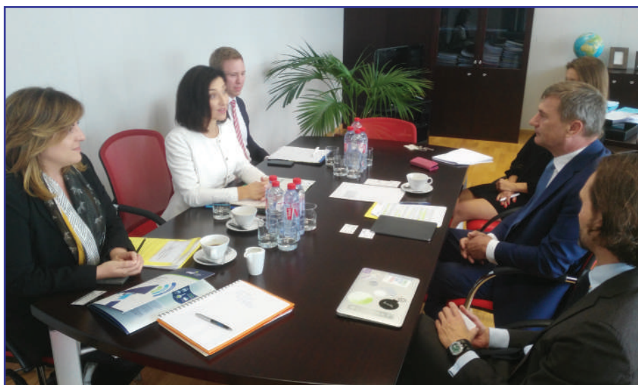
CEEP meeting with Andrus Ansip, European Commission Vice-President for the Digital Single Market