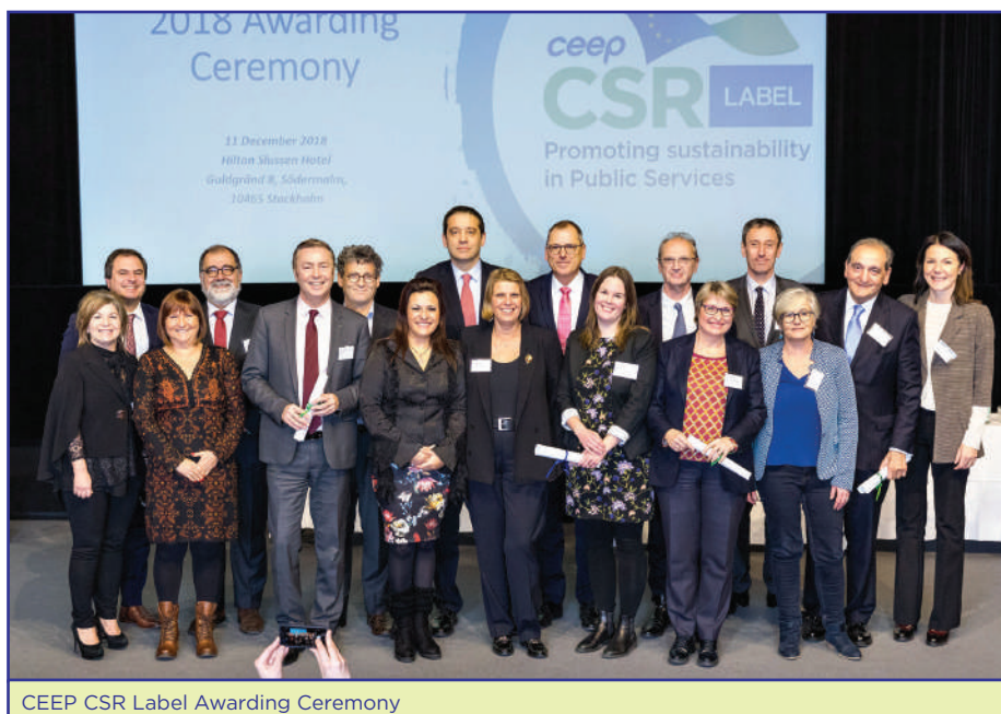
CEEP CSR Label Awarding Ceremony

Ambiente Servizi S.p.A. – Italy APS – Administração dos Portos de Sines e do Algarve, S.A. – Portugal BS|ENERGY – Germany CILIOPIÉE – France EMATSA - Empresa Municipal Mixta d'Aigües de Tarragona – Spain EMEL – Empresa Municipal de Mobilidade e Estacionamento de Lisboa – Portugal GEBALIS – Gestão do Arrendamento da Habitação Municipal de Lisboa, E.M., S.A. – Portugal Groupe SERL – France Gruppo HERA – Italy Junta de Freguesia de Olivais – Portugal SEM Plaine Commune Développement – France SEMEAST – France SIC – Real estate company of New Caledonia – France