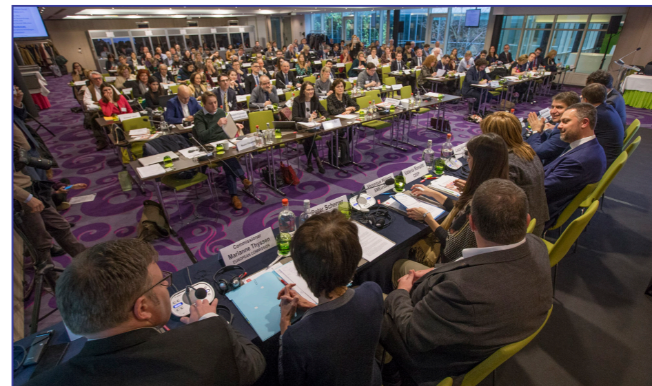
Social Partners' Conference on "Promoting and reinforcing the EU social dialogue", 6 February 2019