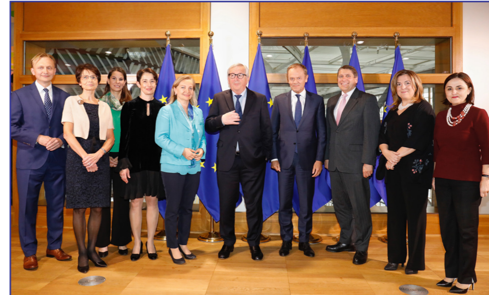
EU social partners' meeting with Jean-Claude Juncker, President of the European Commission, and Donald Tusk, President of the European Council