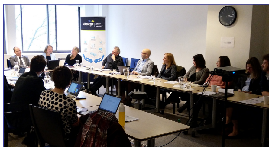
Meeting of the Environment Task Force