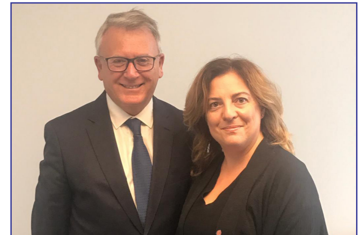
Meeting with Nicolas Schmit, European Commissioner for Jobs and Social Rights