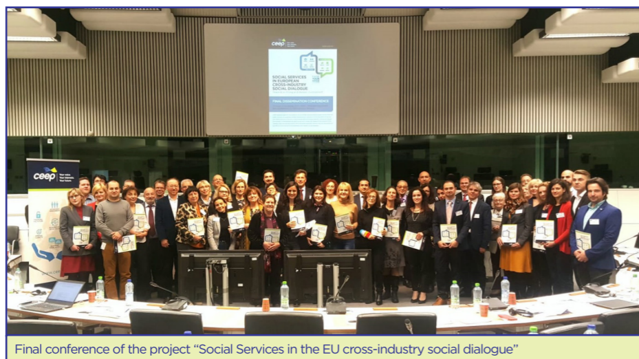
Final conference of the project "Social Services in the EU cross-industry social dialogue"