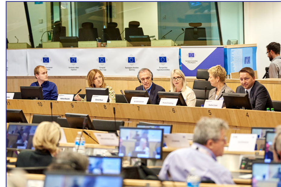
Event organised by the European Committee of the Regions on 10 July, "Together for a Strong Cohesion Policy 2021-2027", with the partners of the Cohesion Alliance