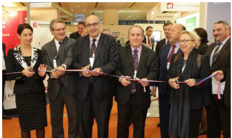
Cutting of the ribbon of the Local Public Services Entreprises Conference

Those enterprises are the key actors of the action of local authorities in their territories, the engine of development and investment, stimulating local employment. In accor-