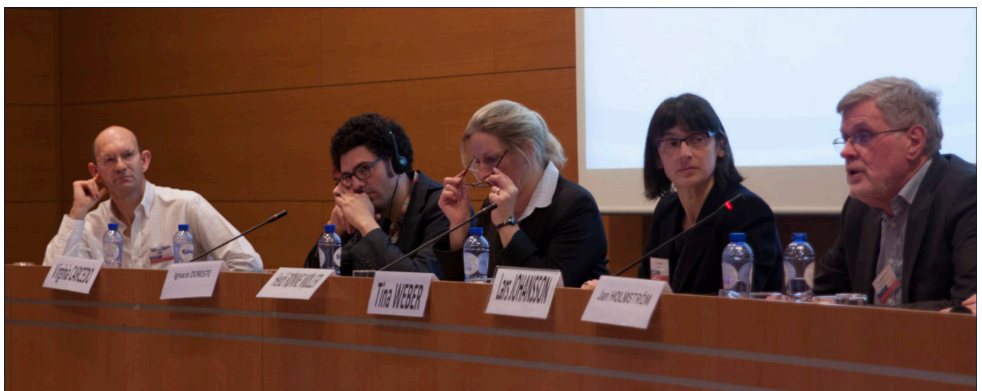
Final event of the Youth Conference