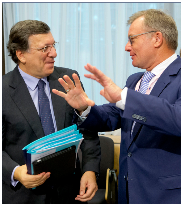
Hans-Joachim RECK and José Manuel DURÃO BARROSO

We support sustainable development and call for social and environmental criteria to be considered in all decisions implementing EU policies such as transport, energy, water supply, waste disposal and telecommunications.