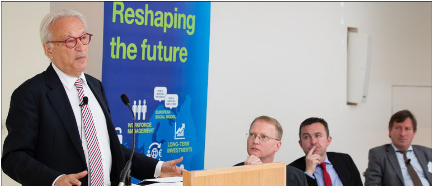
Hannes SWOBODA, President of the group of the Progressive Alliance of Socialists and Democrats at the European Parliament