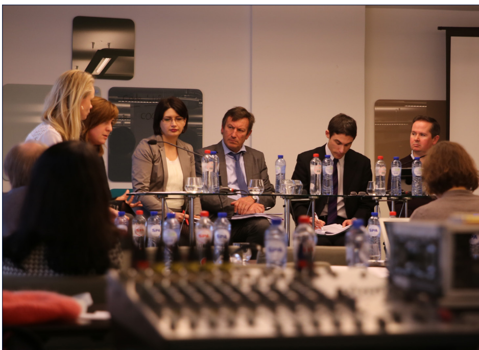
Final conference of the Matching education programme