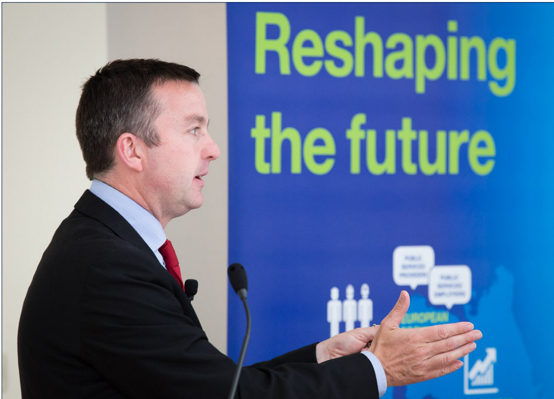
Brian HAYES, Irish Minister of State with special responsibility for Public Service Reform