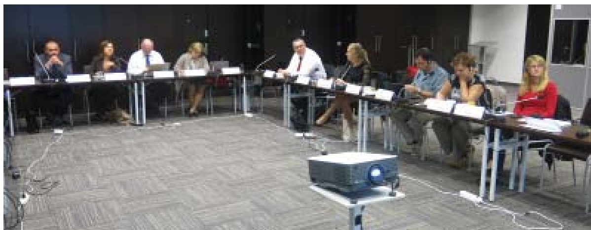
CEEP Project, seminar in Prague