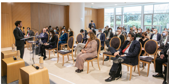
SGI Europe CSR Label Awarding Ceremony, hosted by EDF

The project’s main objective was to improve training systems and ensure inclusive, quality and effective skills provision and long-term skills strategies to foster innovation and encourage innovation outcomes through the engagement of social partners, especially in the industry 4.0 revolution (and its new technologies and challenges).