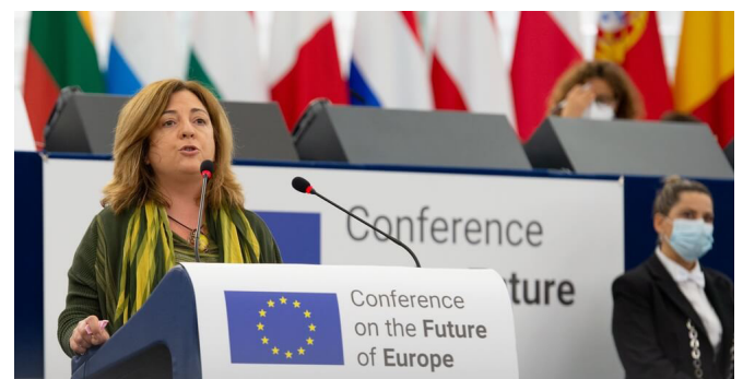
Valeria Ronzitti, SGI Europe General Secretary, during the opening plenary of the Conference on the Future of Europe

Building upon the participation at the inaugural plenary on 19 June 2021 in Strasbourg, SGI Europe raised the profile of SGI employers and providers, making sure they were included in the future for an improved, more efficient and citizen-centric Europe.