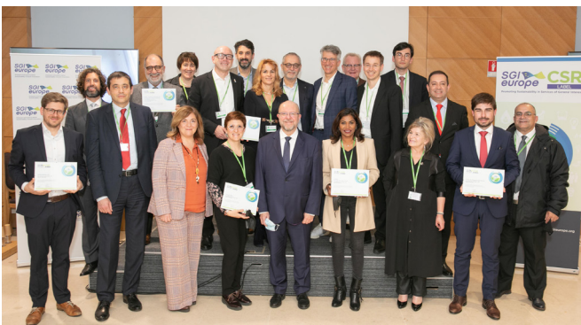
SGI Europe CSR Label Awarding Ceremony, hosted by EDF

SGI Europe also carries out projects promoting the importance of modern services and SGIs in Europe . Whether supported by the European Commission or carried out independently, SGI Europe brings a new light on services of general interest, their modernisation and their central role in citizens' lives.