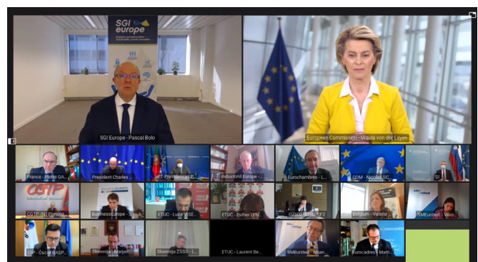
SGI Europe at the Tripartite Social Summit, with Ursula von der Leyen, President of the European Commission

Balancing risks and opportunities, SGI Europe put forward a middle way, proposing to EU institutions to take a supportive approach to Member States and national social partners in their diverse efforts to provide a clearer framework for the platform economy.