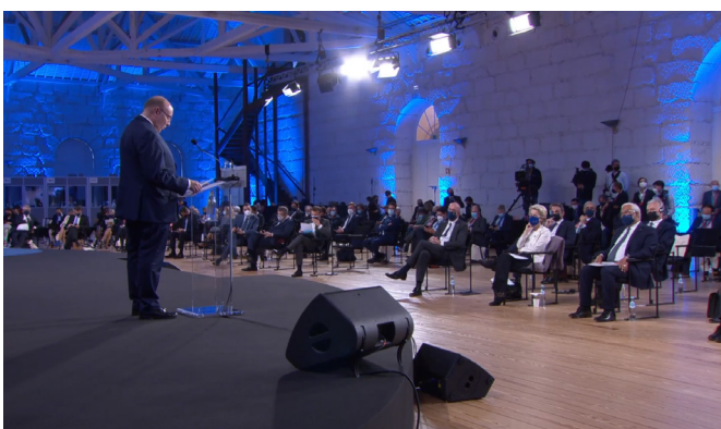
Pascal Bolo, SGI Europe President, addressing the Porto Social Summit

The Porto Social Summit also provided a unique opportunity to recall the crucial contribution of providers and employers of services of general interest in shaping social and territorial cohesion and economic growth in Europe . In the context of the post-COVID19 recovery, the current challenges require an ambitious implementation of the European Pillar of Social Rights, based on a new paradigm recognising productive investments in “essential” services as levers for an inclusive recovery, as well as a new impetus for national labour market reforms based on social dialogue .