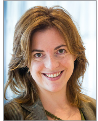
Katherina Reiche, President